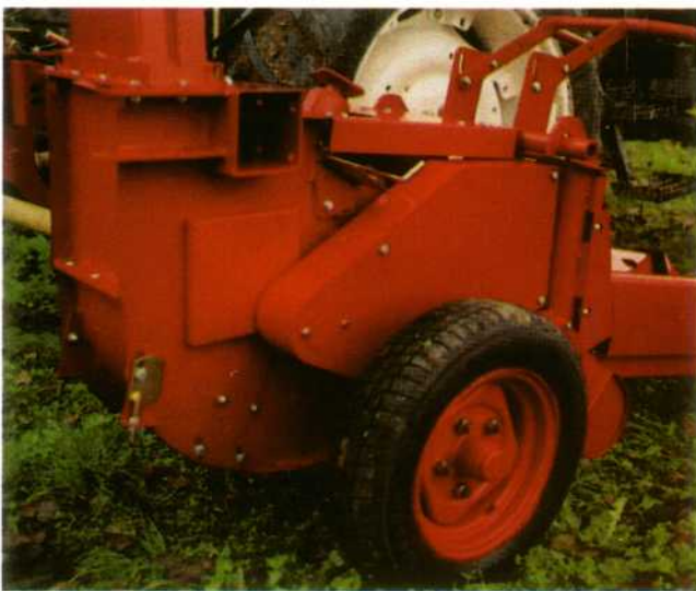
Details of safety guards

* cutting lengths requiring optional sizes