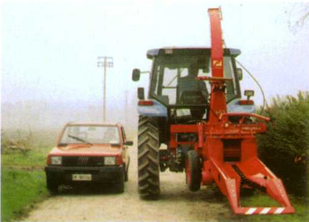
Road transport with folder cross bar

The Forage Harvested mod. 343 is the new tractor mounted Forage Harvested with high performances, it is a valid answer to the needs of the modern farm. It is designed for tractor from 50 to 100 HP. Big output, minimum power absorption, great reliability, rasy and reduced maintenance. With its several accessories, on request, it is a complete machine that meets any needs of the customers.